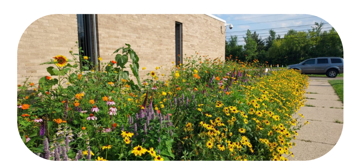
Master Gardeners Project at the Wayne County Department of Health, Human & Veterans Services in Wayne

MSU Product Center fosters strong and successful community food-based businesses by providing one-on-one food business support with Innovation Counselors, processing authority review for shelf stable products, as well as other services, such as nutrition facts and analysis, business development, strategic planning, and marketing analytical insights.