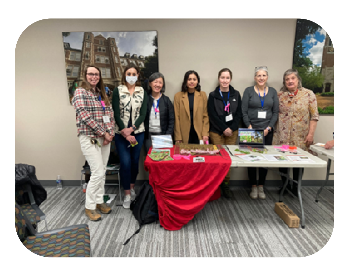
Wayne County Conservation Stewards presenting their capstone project at the MSU Detroit Center

Find out more about MSU Extension Sea Grant programs on our website: www.canr.msu.edu/michigan_sea_grant/