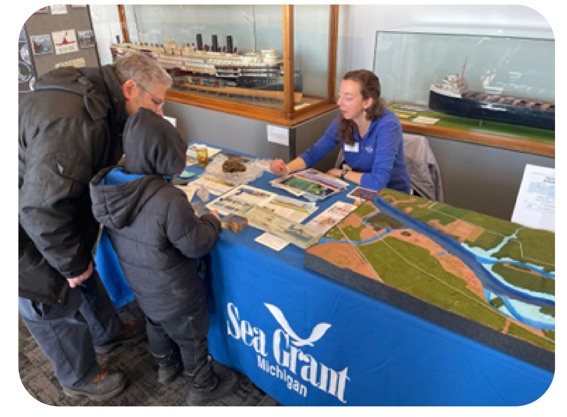
Answering questions at the Shiver on the River Eco Fair at the Great Lakes Dossin Museum in Detroit