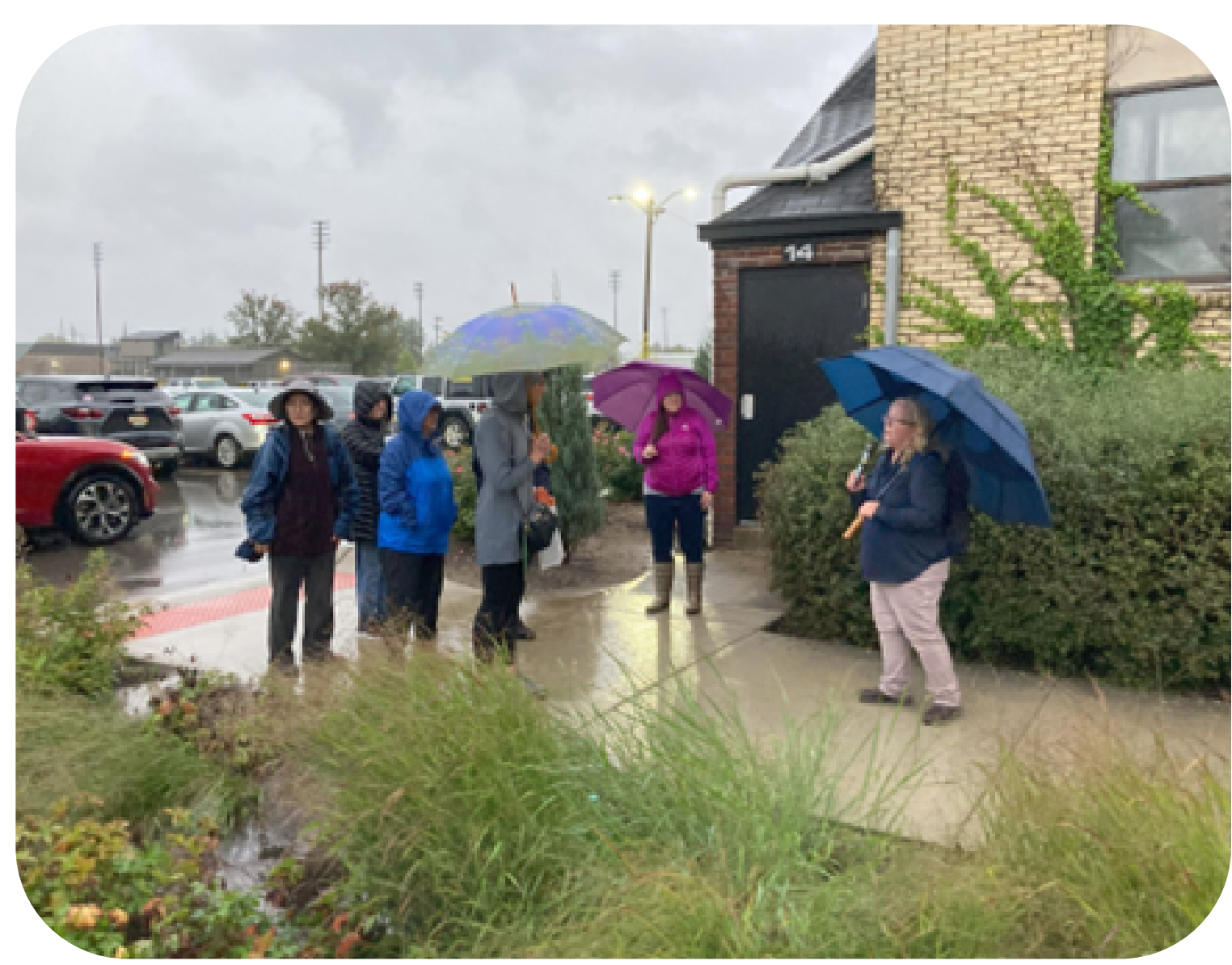
Wayne County Conservation Stewards class viewing rain gardens in use at the PARC in Plymouth

Michigan Sea Grant also offers many free online programs including an annual Fishery Workshop that highlights the status of fish populations in the Detroit River and Lake Erie, Birding 101 events in the spring and fall, and a planning and zoning email course for local officials.