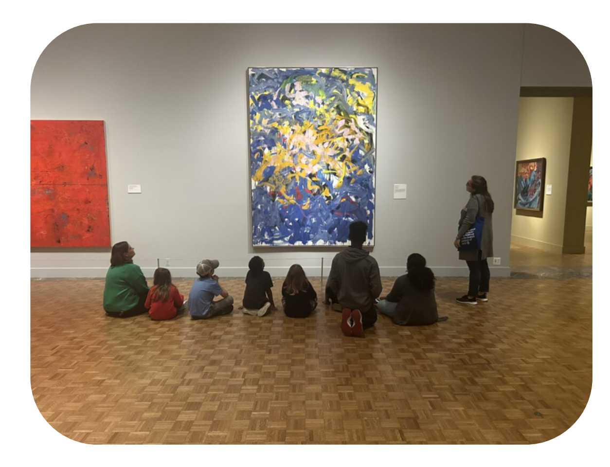
4-H Mental Health Awareness at the Detroit Institute of Arts

Consumer Horticulture serves home-gardeners, community gardens, non-profits, and community groups, seeking information to improve gardening practices. To become a Certified Extension Master Gardener, trainees must first complete the "Foundations of Gardening" ten-week class to learn about horticulture and research-based practices, volunteer onboarding, and 40 hours of educationally focused volunteer service to the community.